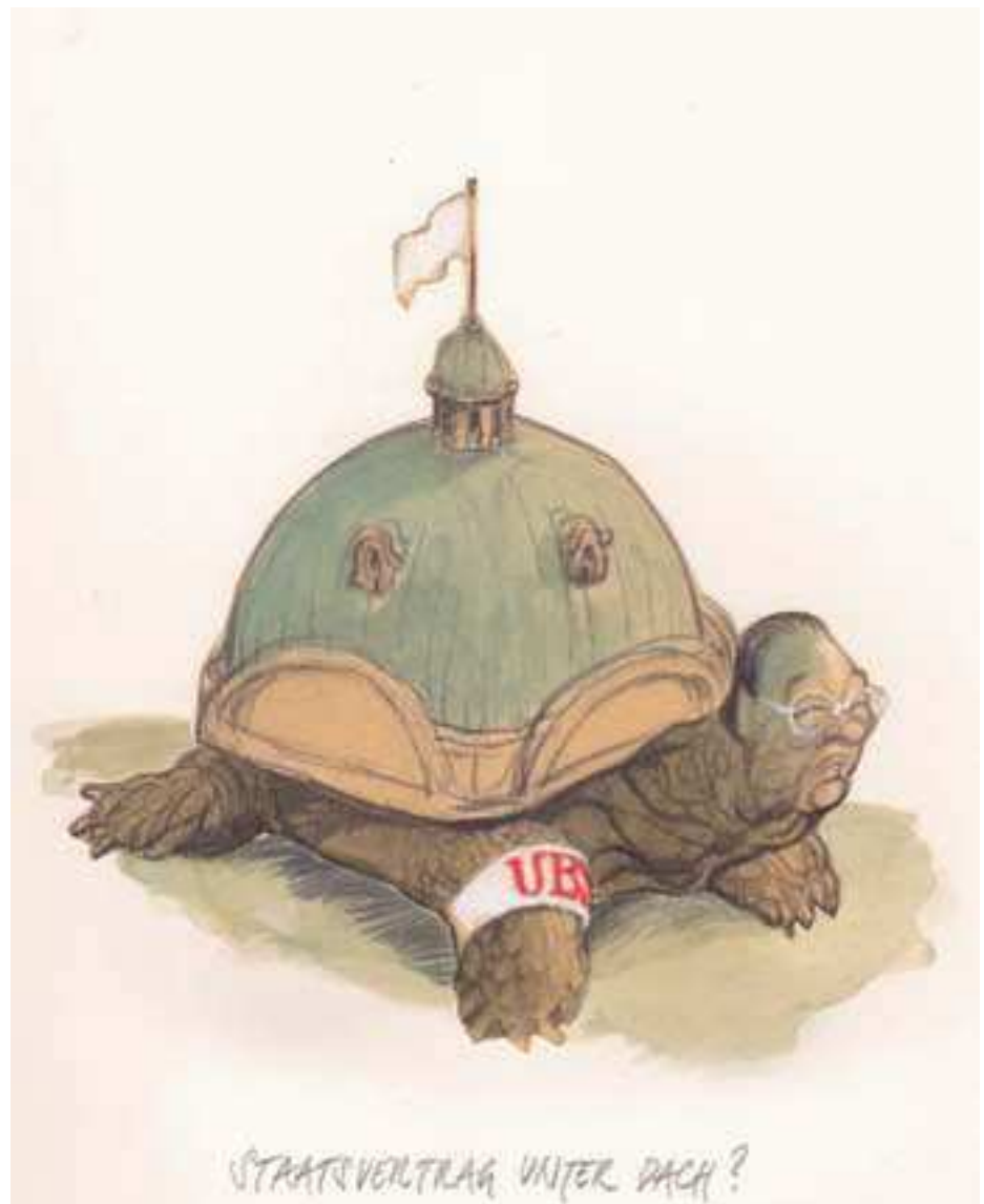
INTERNATIONAL TREATY DONE AND DUSTED